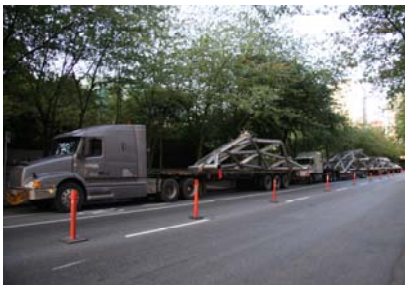
Each dome was spliced into 4 sections before being shipped to site.