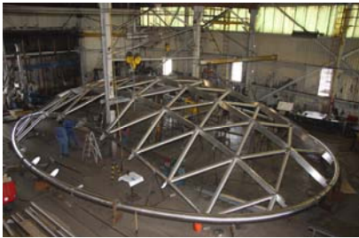
Each piece of the two domes were fabricated and preassembled before site installation