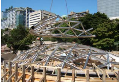
It took only 1 day for each dome to be successfully erected and fitted.